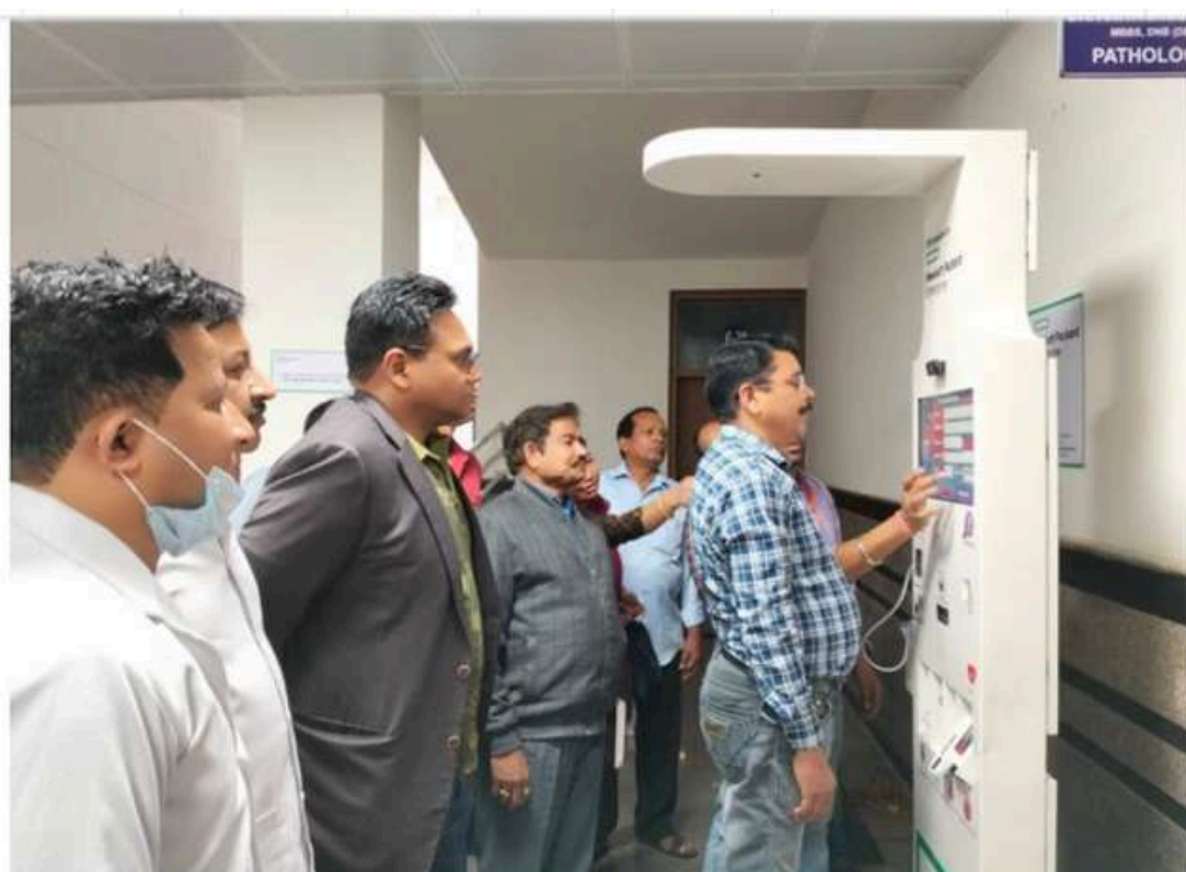
Health secretary inspecting a health ATM