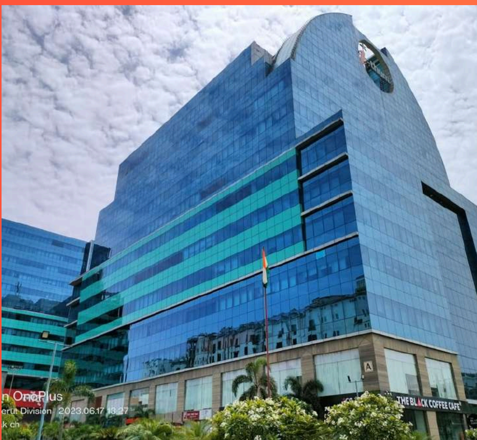
CORPORATE OFFICE plot No. A 40, Tower B 310 A I THUM, Noida Sector 62, UP( 201309)