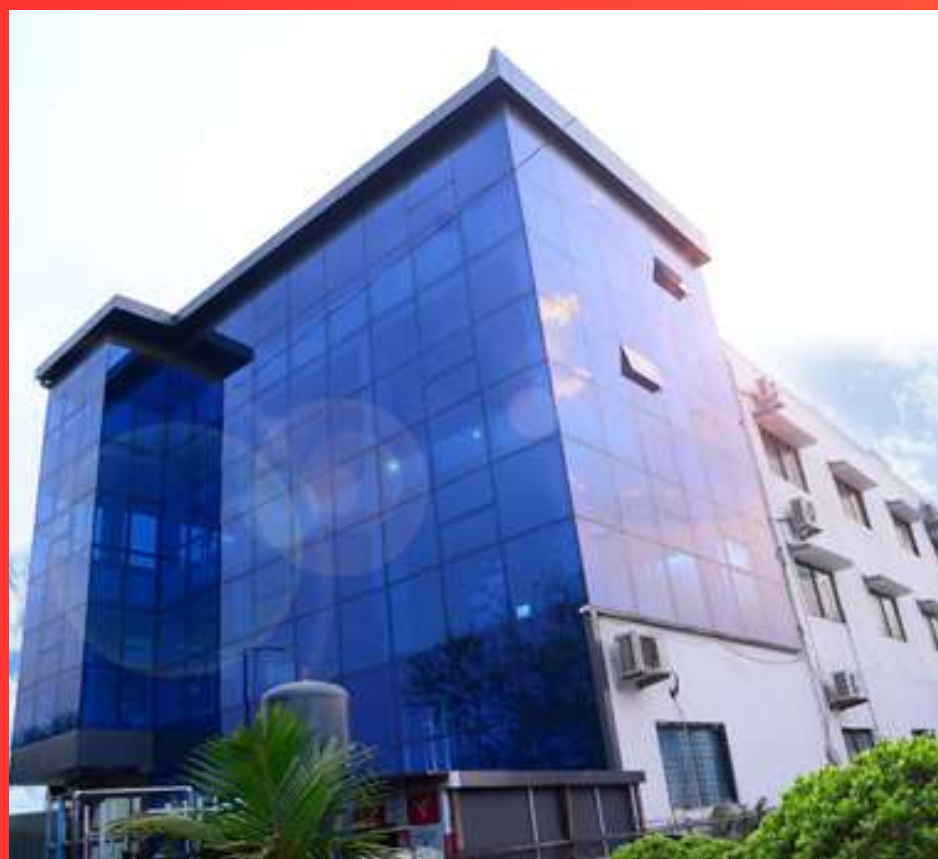
MANUFACTURING UNIT Gat No. 1532, Sonawane Wasti, Chikhali, Pune- 411062