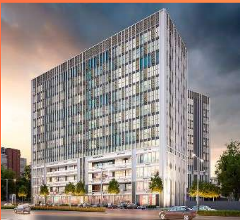
CORPORATE OFFICE A/411, Ratnaakar Nine Square, Opp- ITC NARMADA NR Keshavbaug Party Plot, Vastrapur, Ahmedabad, Gujarat,- 380015